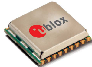
MAX-M8 series: 9.7 x 10.1 x 2.5 mm