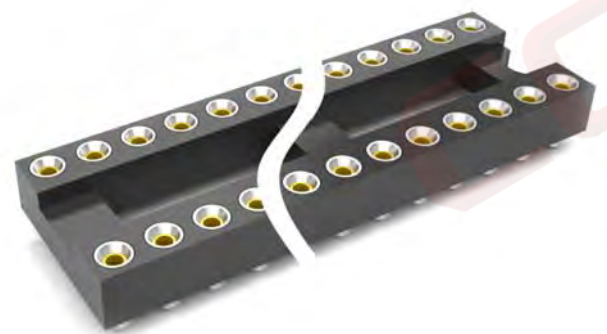
(Series Image-Reference Only)