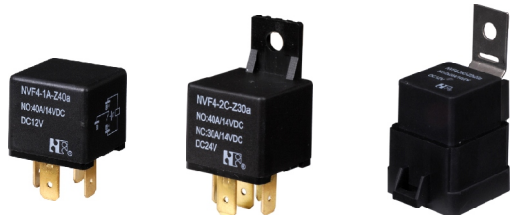
NVF4-1 NVF4-2 NVF4-2b 26.5 × 26.5 × 24.5(+15.5) 35.5 × 35.5 × 45.5(+22.5)